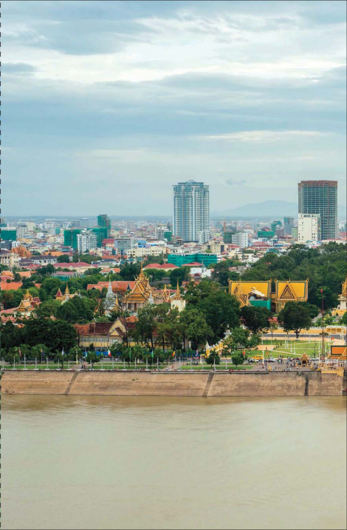
Sokha Phnom Penh Hotel & Residence | Phnom Penh | Cambodia